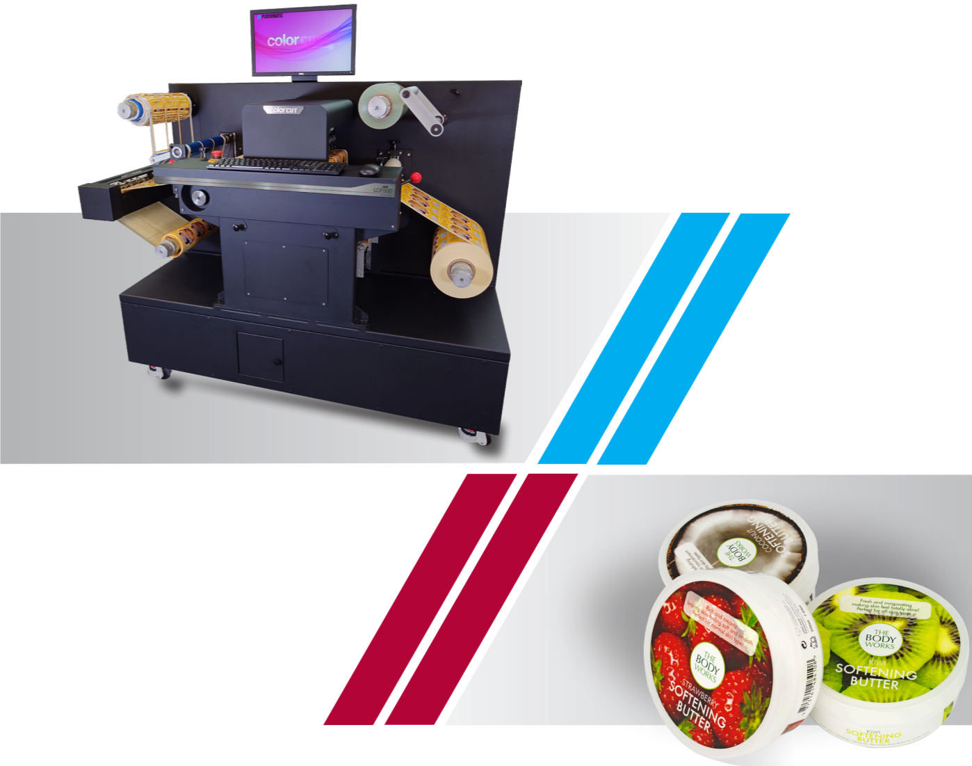
Intec LCF500 Pro Roll-to-Roll Label Cutter Finisher