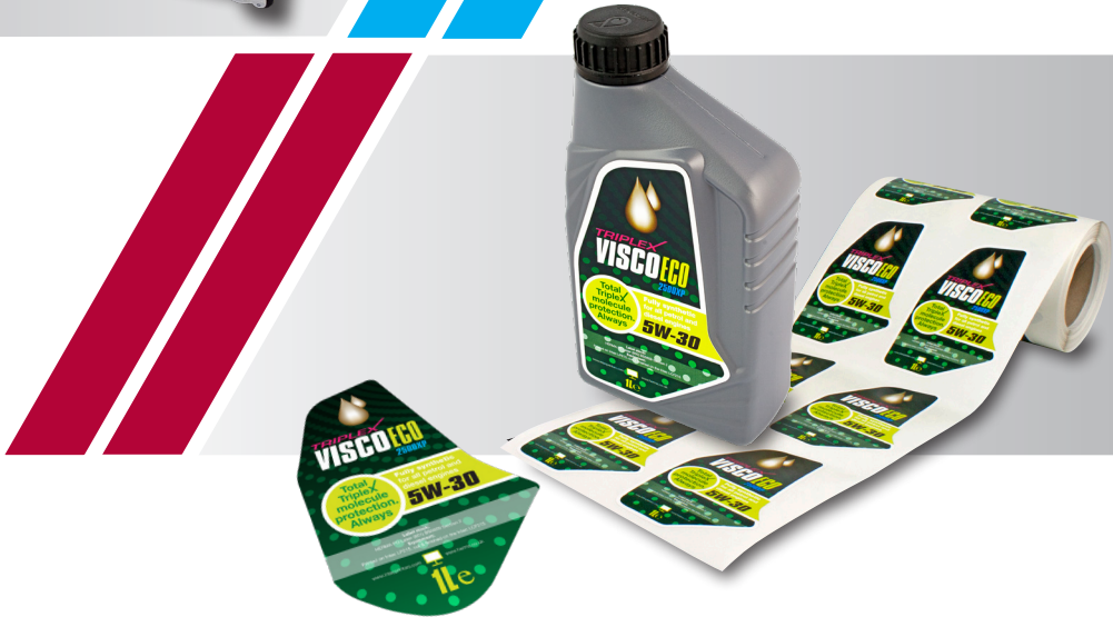
Intec LCF520 Pro Roll-to-Roll Label Cutter Finisher